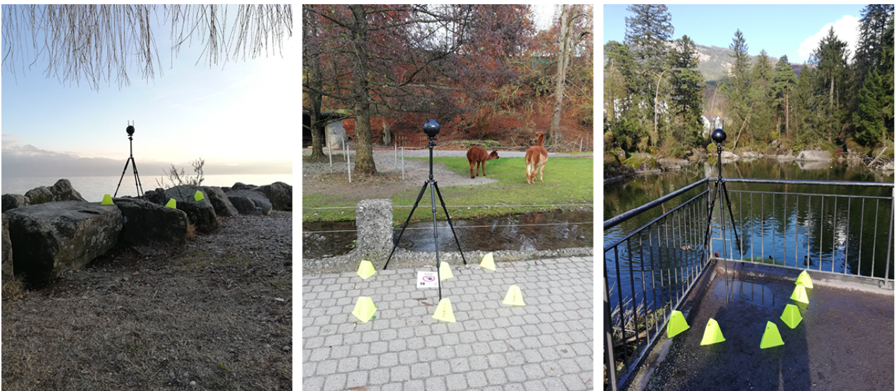
Figure 2. Examples of on-location shooting using fluorescent cones to make passersby aware of the tripod and camera.

Finally, as this setup may appear intriguing to passing individuals, it may be useful to consider some protective measures. Specifically, it may be useful to attach signs to the camera tripod, warning individuals to refrain from approaching or touching the camera, as this may disrupt the recording and have a disorienting effect on the viewer. Florescent cones can also be placed around the base of the tripod to prevent individuals from approaching the camera or accidentally knocking the camera down ( Figure 2 ). Any person or object that comes close to the camera can cause discomfort for the end user, as they might feel that the object approached too close to them. Lastly, as the camera captures footage of its entire surroundings, there is no way for someone who does not wish to be filmed to pass by undetected. To prevent problems associated with this issue, it can be useful to place signs at an appropriate distance from the camera that warn passersby that they will be filmed if they continue on this path. Individuals who do not wish to be filmed can then choose an alternative route.