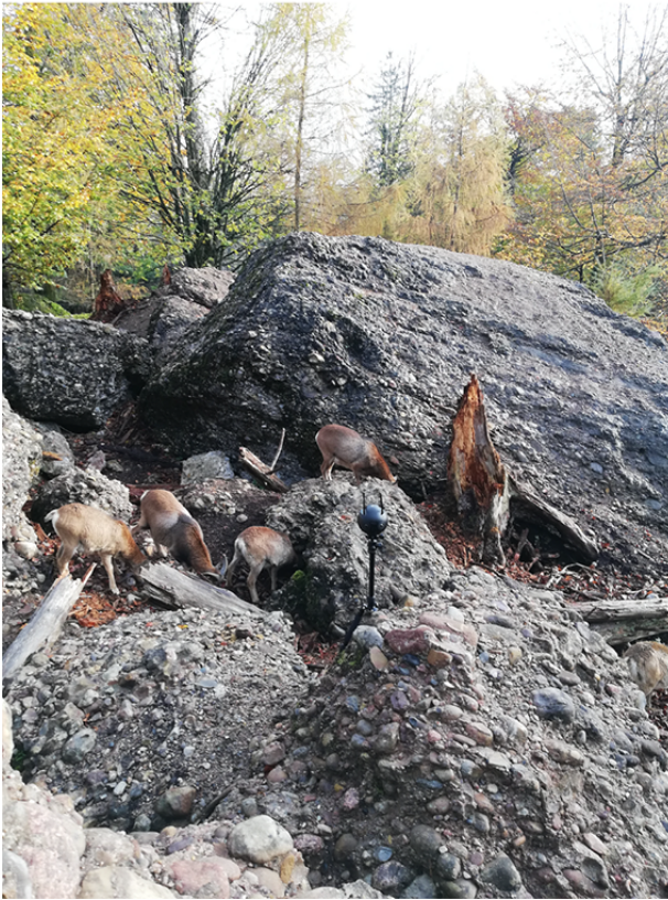
Figure 3. Camera setup and examples. (Left) Camera setup while filming on-location. (Top right) Screenshot of the final postprocessed video as it would be seen using the VR headset. (Bottom right) Insta360 Pro II camera (Arashi Vision Inc) showing the control panel. VR: virtual reality.